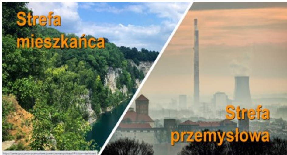
The Industrial Zone